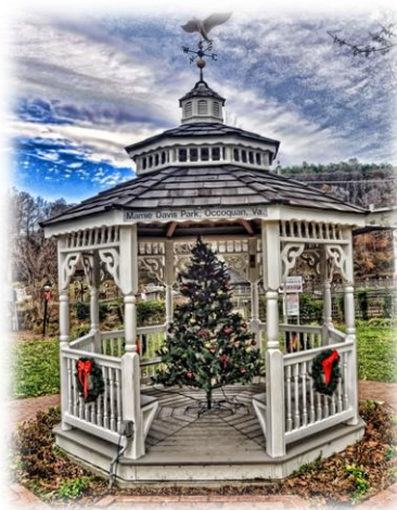
The Gazebo in Mamie Davis Park

Mill House Museum, PO Box 65, 413 Mill Street, Occoquan, VA 22125 www.occoquanhistoricalsociety.org 703-491-7525 Open Sunday through Saturday 11-4