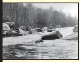
Part of ironworks wall, ca. 1900

Samuel M. Janney constructed a four-story, 38-by-55-foot cotton mill and related buildings to your left in 1828. The complex, enclosed by a fence, stood on the site of the park. A passage connected the mill with a picking house, while the waterwheel was located on the south side of the mill near the