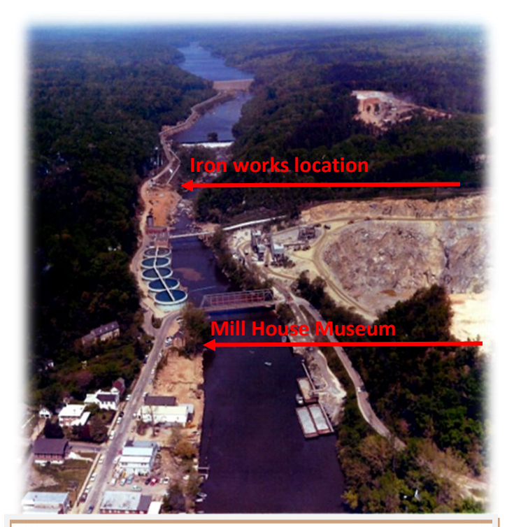
Above: 1960's aerial view of Occoquan indicating the location of the current Mill House Museum structure and the site of the eighteenth century iron works.